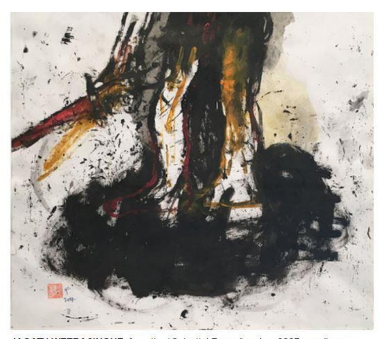
JAGATH WEERASINGHE , from the "Celestial Fervor" series, 2007, acrylic on paper, 29.2 × 28 cm.

From 1983 to 2009, a grisly civil war gripped the island nation of Sri Lanka. In the aftermath, 13 artists unpacked the trauma of war as part of the group exhibition "Portraits of Intervention" at Aicon Gallery in New York. Curator Bansie Vasvani said she was drawn to the organic quality of these artists' responses to the bloodshed, as well as the variation in form found in those reactions.