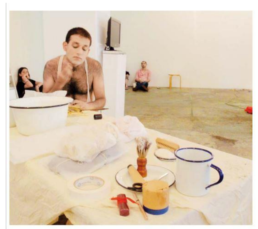
Performance artist Nikhil Chopra enacts Sir Raja III Visits New York City at

Aicon Gallery's two-week-long exhibition, titled Delicate Bond of Steel, opens on November 9 at Chatterjee and Lal; in turn, the Colaba gallery will present a show at Aicon Gallery slated for 2017.